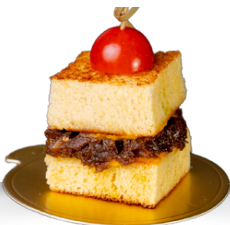
Creamy Lamb Cobs