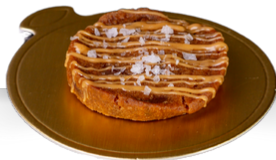
Peanut Salt Caramel Cookies 7