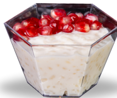
Rice Pudding 8