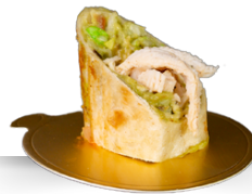
Avocado Chicken Wrap