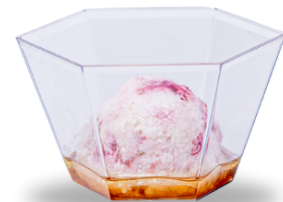
Goat Cheese Raspberry