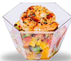
Mango Avocado Shrimp