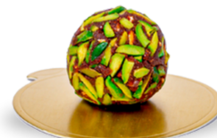
Energy Ball 3