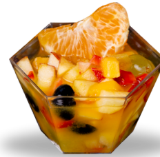
Fruit Salad 6