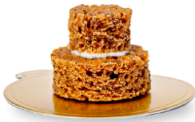
Banana Loaf 1