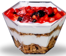
Cheesecake Cup 2