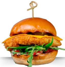
Chicken Tender Slider