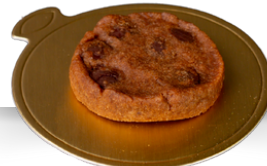
Mini Choco Cookie 9