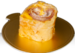
Turkey Cheese Roll