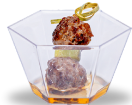
Meat Ball Maple