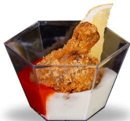
Wings in Dip