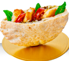
Haloumi & Zattar Pita